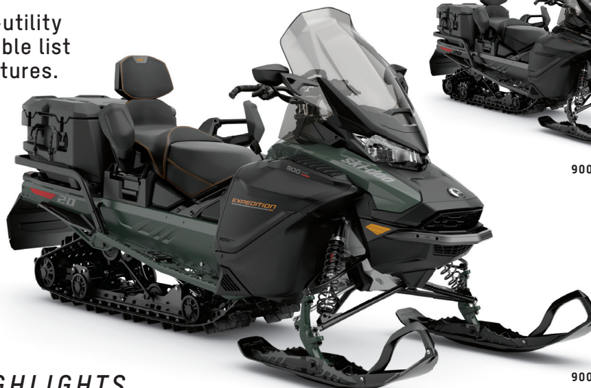
EXPEDITION SE 900 ACE TURBO SHOWN

The utmost crossover-utility vehicle with an incredible list of work and luxury features.