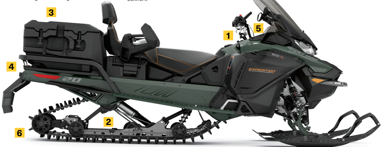
EXPEDITION SE 900 ACE TURBO SHOWN

135 L/35.7 US gal of lockable, weather-resistant storage capacity. Incorporated hatchet and saw holder, plus attachment points for bungees and two 16 in. LinQ positions on top for expandable accessory use.